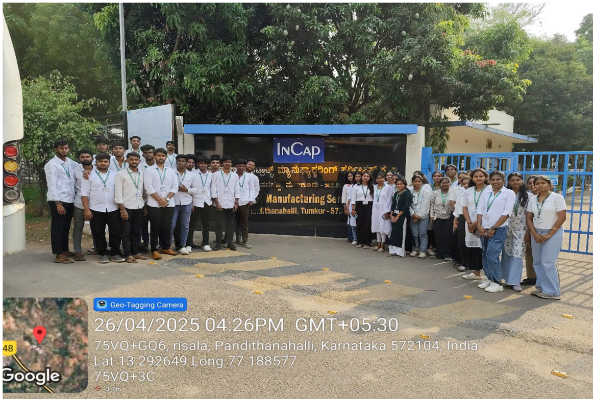
Photos at InCap Industry