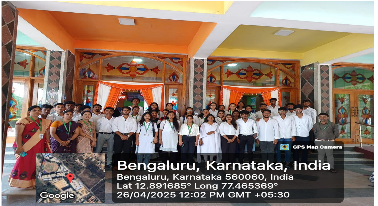
Group Photo at College premises