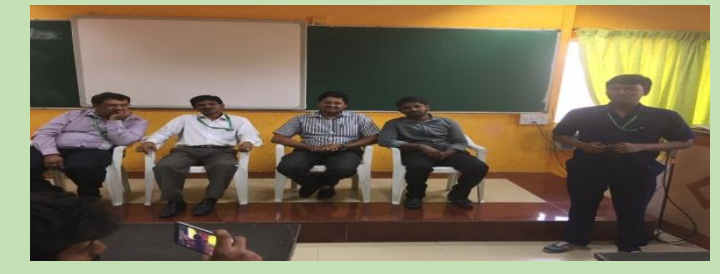
Students feedback about the two days work shop