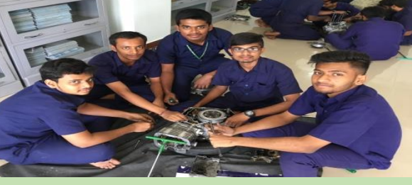
For Pre Final year students Industrial Trainers explain about the I C Engines