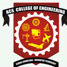
ACS College of Engineering