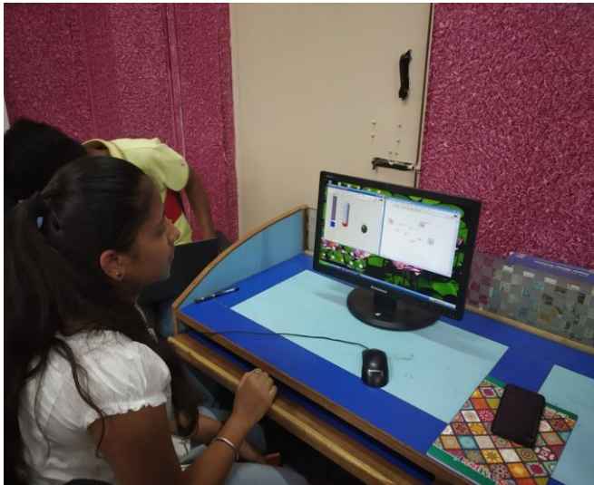
Students using LabVIEW software during the workshop