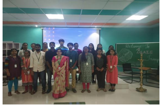
Office bearers of the BLAZE committee were introduced.