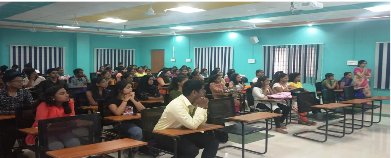
Biomedical staffs and students during the inauguration of BLAZE 2018.