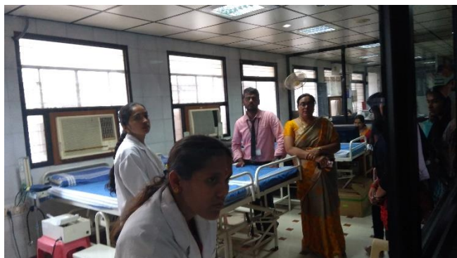
Blood bank visit