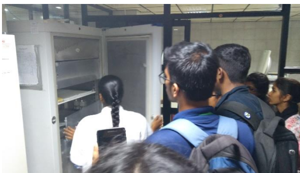
Students witnessing how to store blood in a freezer