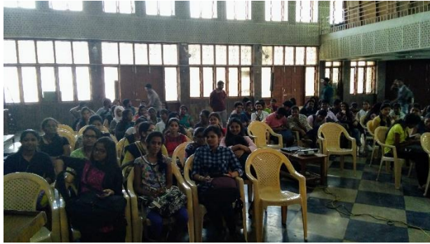
Students during the awareness about blood storage