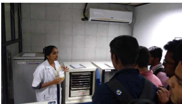
During the explanation