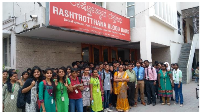
Biomedical Engineering faculty and students at Rashtrorothana Blood Bank