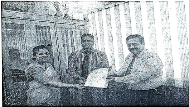
Coordinator, HOD, Principal