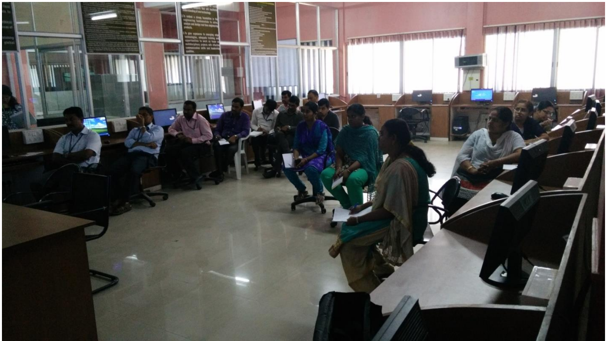
The ECE dept faculty present in the technical talk