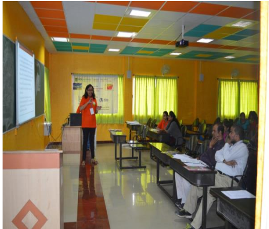
Students participation during National level technical symposium "Neurotechoblitz -2016"