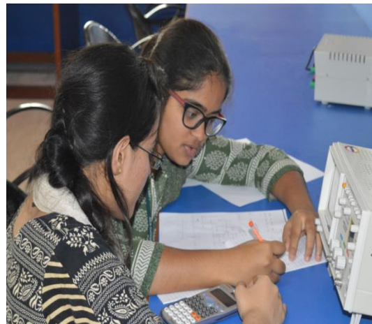
Students participation during National level technical symposium "Neurotechoblitz -2016"