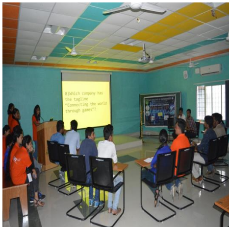
Students participation during National level technical symposium "Neurotechoblitz -2016"