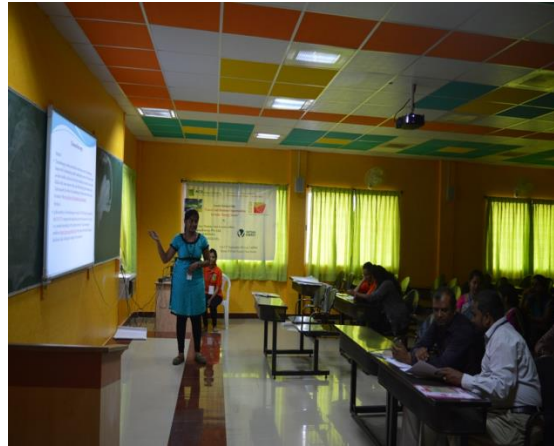
Students participation during National level technical symposium "Neurotechoblitz -2016"